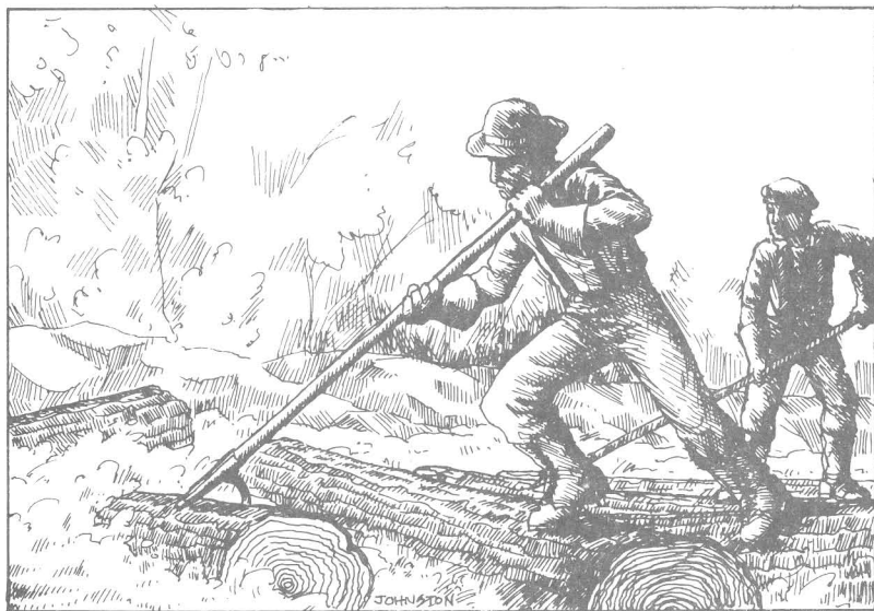
Logdrivers at work.