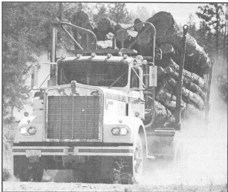
B.C. Forest Service

“The Truck Driver’s Song” reveals how one man thinks and feels about truck driving. His personal view is so concretely and directly stated that we not only share his experience but feel that it presents a general truth about driving the great haulage trucks. The song tells what it’s like behind the wheel.